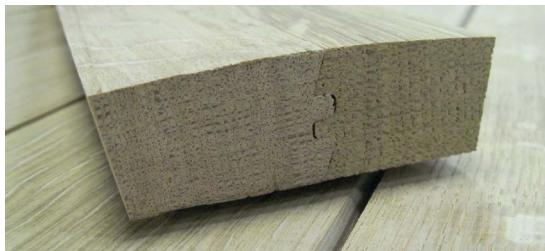
Patented slot-saw assembly

The main feature of the ECO 3 is in its composition of micro-staves (narrow stave width but standard thickness and respect for the wood fiber thread). During assembly, two small, non-standard width staves are joined together using the Patented slot-saw process to obtain a standard dimension stave.